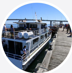
San Remo Jetty 170 Marine Parade, San Remo